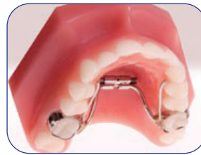
Mini RPE - 2 Arm

With our fixed expanders, you will receive your choice of activation keys; either the safety strap by request or swivel stick key which comes standard. You will also receive a reminder card indicating the total expansion capability and number of activation turns.